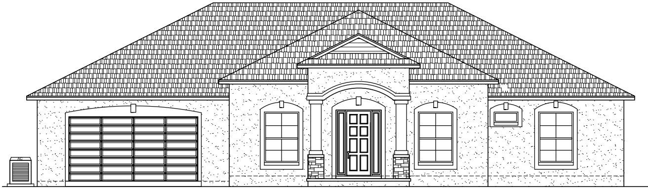
THE LABELLE (73'-4"W X 62'-0"D) © COPYRIGHT TRINITY DRAFTING LLC